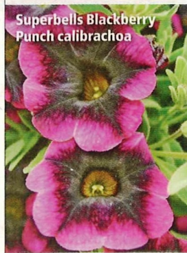
Superbells Blackberry Punch calibrachoa

"The pink stays so bright all summer long." It's a warm-season grass, so treat it as an annual. It won't survive outside in the wintertime.